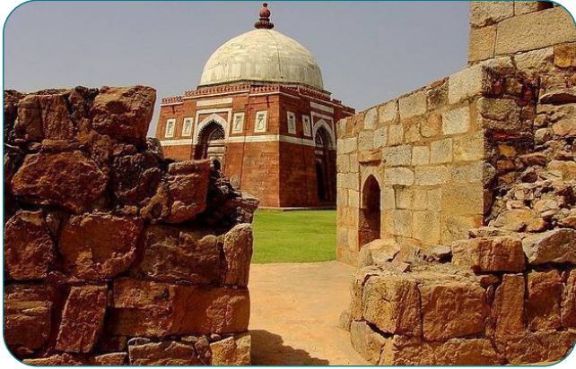
Baba Farid Tomb